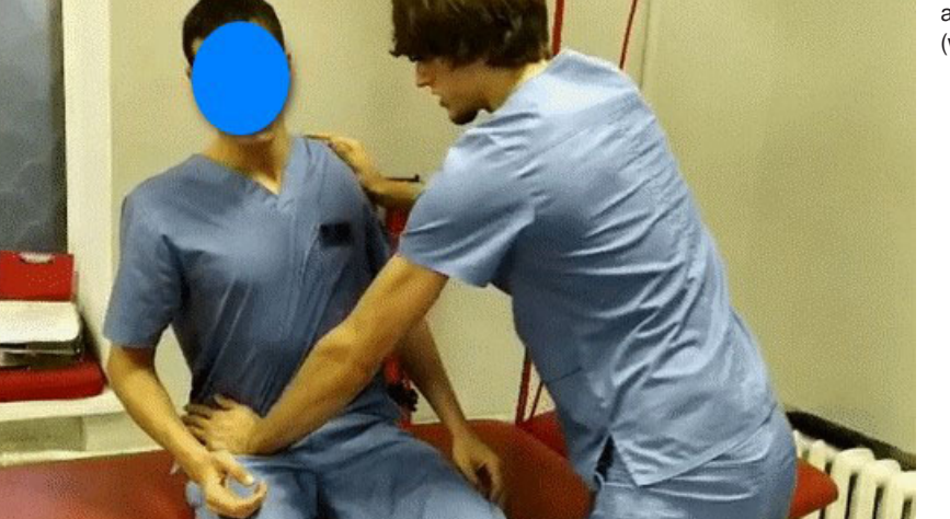
Figure 3. Synchronization of shoulder and pelvic patterns with torso patterns (with flexion and extension synergy)

Figure 2. Synchronization of the shoulder blade and pelvic patterns by using a proprioceptive neuromuscular facilitation pattern